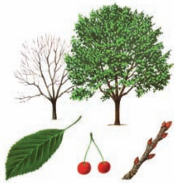
Wild cherry Gean - crann silíní fiáin

T impeall 12,000 bliain ó shin, bhí Éire clúdaithe le sneachta agus oighear. Aithníodh í seo mar an Oighearaois. De réir mar a d'éirigh an aimsir níos teo, leáigh an sneachta agus an oighear agus thosaigh crainn ag fás. Thug éin agus ainmhithe síolta na gcrann mar an coll agus an dair anseo, trasna na droichid talún ón mBreatain agus ón gcuid eile den Eoraip. Tá na síolta ó chrainn eile, mar an tsailleach agus an bheith, chomh héadrom sin gur séideadh anseo iad ag an ngaoth. Ag deireadh báire, d'ardaigh na farraigí, bhí na droichid talún faoi uisce agus deineadh oileán d'Éirinn. Is iad ár gcrainn dhúchasacha ná na crainn a bhain an tír seo amach sular scaradh sinn ón gcuid eile den Eoraip. Cuimsíonn ár gcrainn dhúchasacha is coitianta dair, fuinseog coll, beith, péine Albanach, caorthann agus saileach. Ag deireadh báire, thug daoine crainn eile go hÉirinn, mar atá feá, seiceamar, crann cnó capaill, sprús, laireog agus giúis.