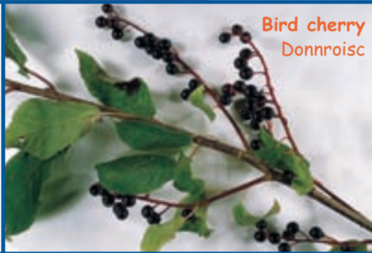
Bird cherry Donnoisc