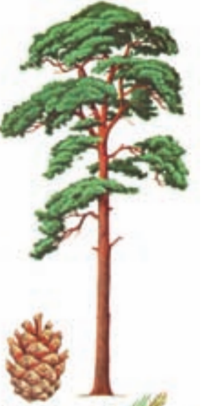
Scots pine Péine Albanach