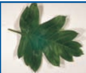
Hawthorn Sceach gheal

A round 12,000 years ago, Ireland was covered in snow and ice. This was known as the Ice Age. As the weather became warmer, the snow and ice melted and trees began to grow. The seeds of trees such as hazel and oak were brought here by birds and animals, across the landbridges from Britain and the rest of Europe. The seeds of other trees, such as willow and birch, are so light that they were blown here by the wind. Eventually, the seas rose, the landbridges were flooded and Ireland became an island. Our native trees are the trees that reached here before we were separated from the rest of Europe. Our most common native trees include oak, ash, hazel, birch, Scots pine, rowan and willow. Eventually, people brought other trees, such as beech, sycamore, horse chestnut, spruce, larch and fir to Ireland.