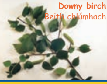
Downy birch Beith chlúmhadh