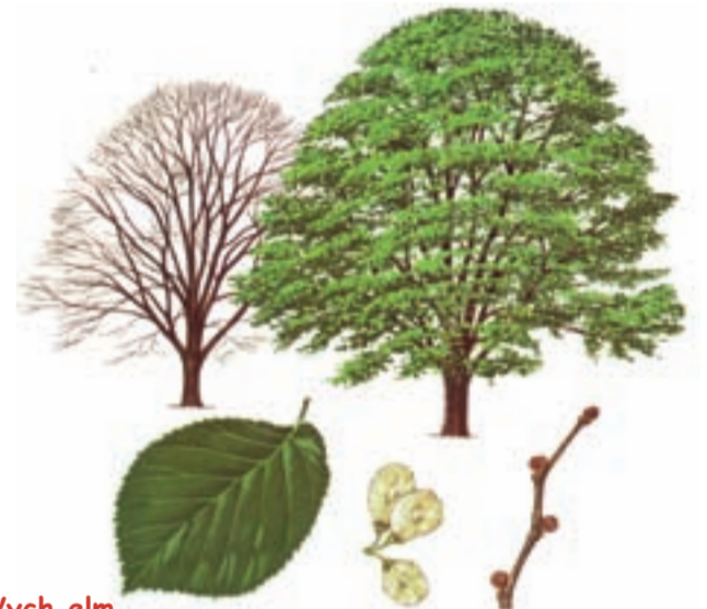
Wych elm Leamhán sléibhe