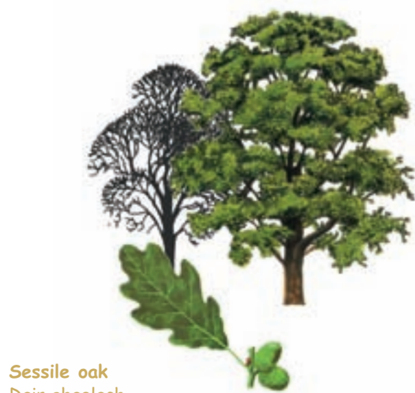
Sessile oak Dair ghaelach