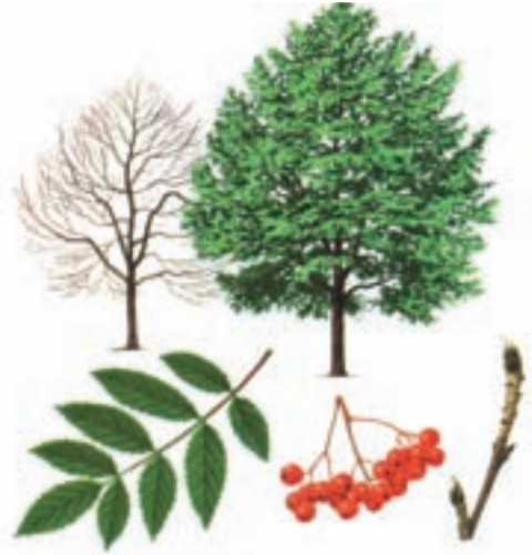
Rowan or mountain ash Caorthann