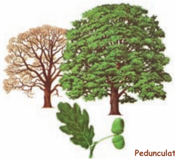
Pedunculate oak Dair ghallda