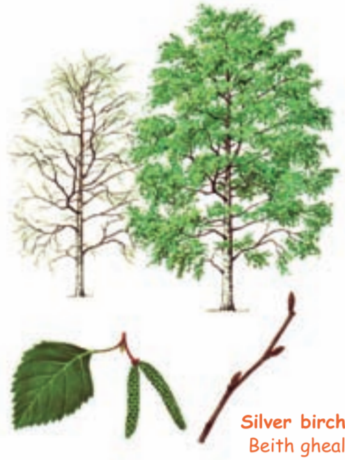
Silver birch Beith gheal