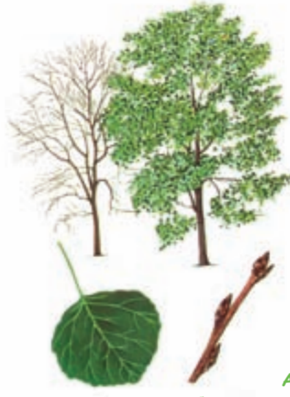
Aspen Crann creathach